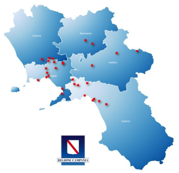
Figure 1. The SEZ in Campania Region.

From an environmental perspective, Italian SEZs (Figures 1 and 2) still have a lot of unrealized potential and a long way to go before they can be sustained. The SEZs in Italy are a component of a political system where choices, decisional drives, or motivation are still being made. These strategies are clearly going to negatively impact Italy's coastal and inland environments. Economic zones are so widespread all over the world that, despite their varied functions and strategies, they always seek to promote economic growth and regional development. The Italian Special Economic Zones, established in Italy in 2017 by Decree-Law No. 91 [48,49] are geographically delimited and clearly identified areas within the boundaries of the State, as well as consisting of non-territorially adjacent areas if they have functional economic nexus, and including at least one port area. Special economic zones offer several types of advantages in addition to automatic tax incentives, such as the distribution of land or buildings or the development of very advantageous procedural and administrative processes for investors <sup>1</sup>.